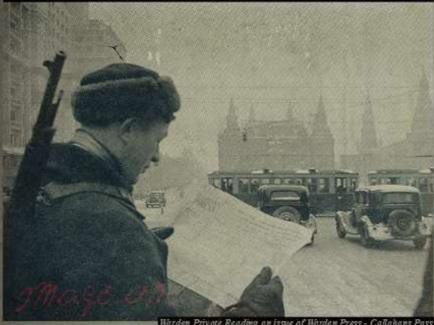
Warden Private Reading an issue of Warden Press - Callahans Pass

Warden's everywhere were excited to hear that the 'Information Censorship Ban' was lifted last-week after Communications and vetting pertaining to figures working in the Media drastically improved.