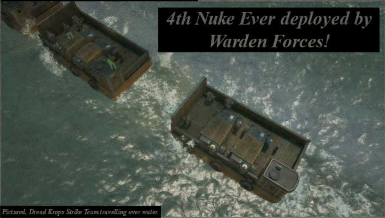
Pictured, Dread Korps Strike Team travelling over water.

4th Nuke Ever deployed by Warden Forces!